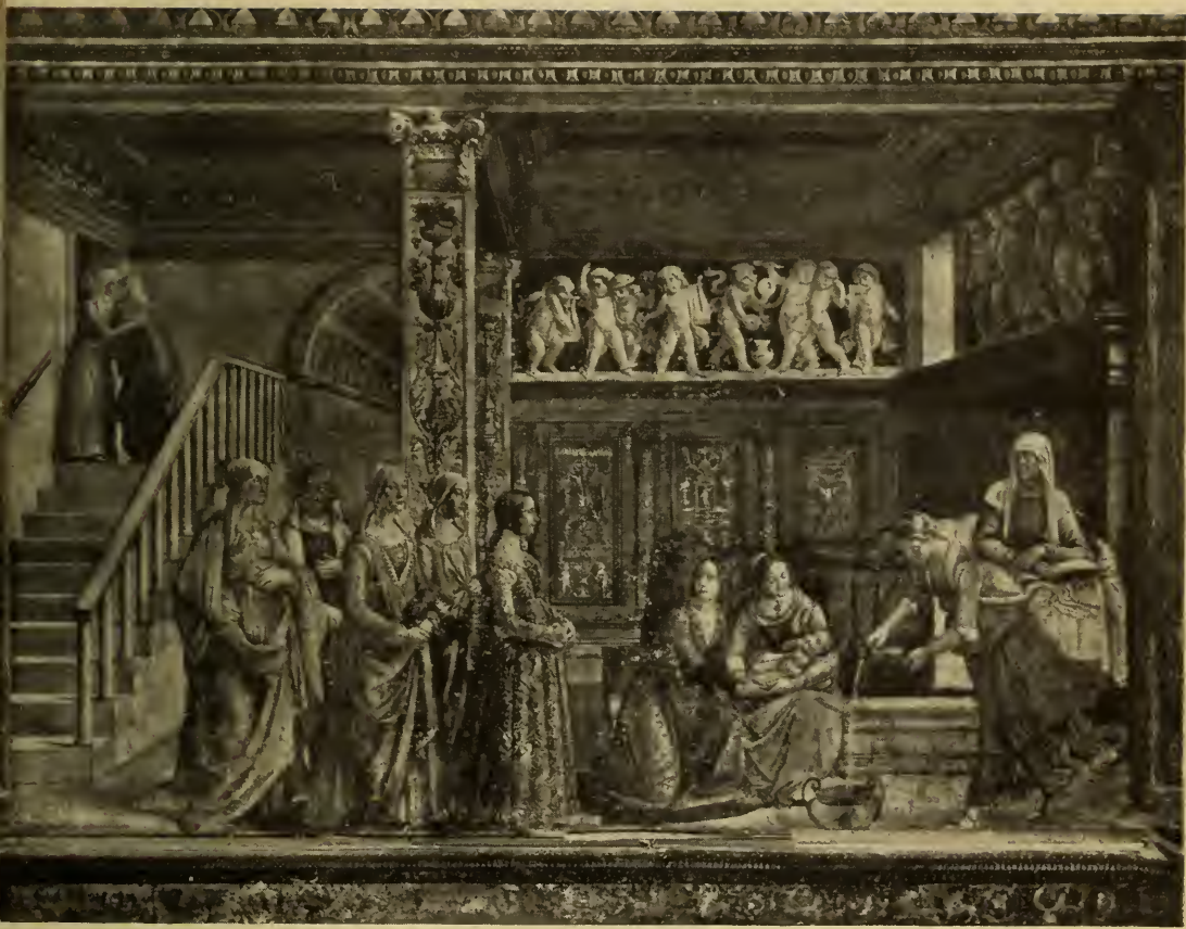
THE BIRTH OF THE VIRGIN FROM THE FRESCO BY GHIRLANDAIO IN S. MARIA NOVELLA